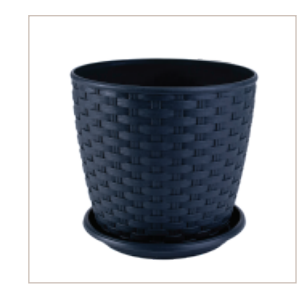
FLOWERPOT «RATTAN» with tray