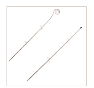
SUPPORT for orhids