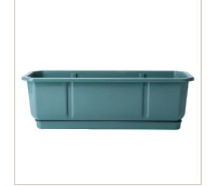
FLOWERPOT «DAMA» WITH TRAY BALCONY