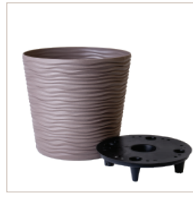
FLOWERPOTS ((FUSION)) with insert low