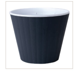
FLOWERPOTS IBIS with insert