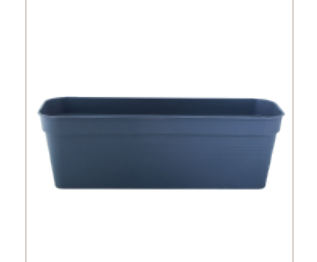
FLOWERPOT (GLORIA) BALCONY