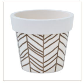
FLOWERPOTS ((GAMMA)) with decor