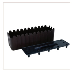
FLOWERPOT «FENCE» BALCONY WITH INSERT