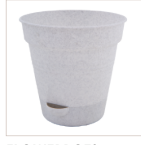
FLOWERPOTS with wattering ((GLORIA))