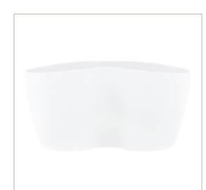
FLOWERPOTS for cactus