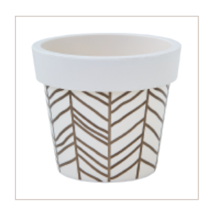
FLOWERPOTS ((GAMMA)) with decor