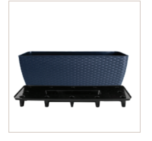
FLOWERPOT «RATTAN» BALCONY WITH INSERT