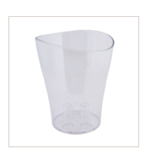
FLOWERPOTS ORHID oval