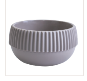
FLOWERPOTS BOHO LOW