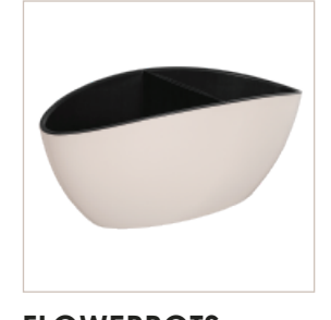
FLOWERPOTS ((CANOE)) with insert