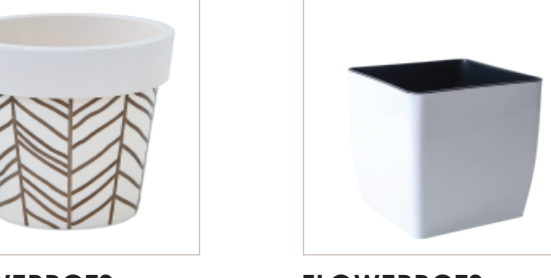
FLOWERPOTS ((QUADRO)) low